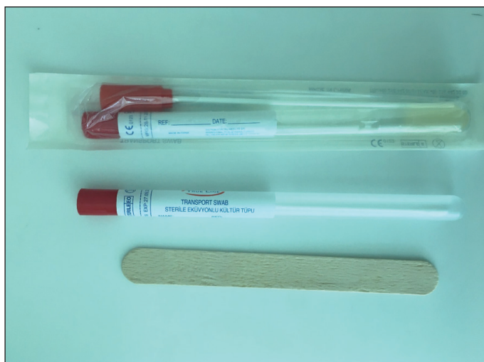
Figure 1. Culture tube with tongue depressor and sterile swab (mediated and dry type).