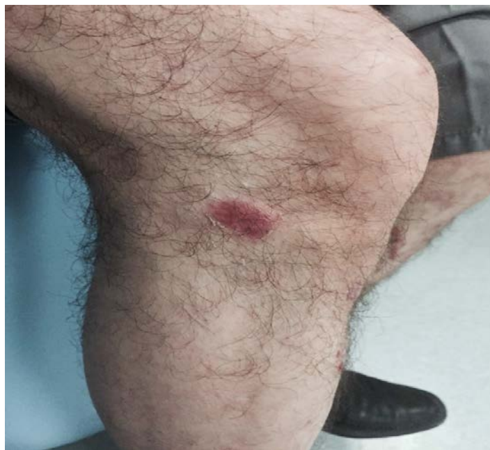
Figure 2 Skin lesion

Pemphigus vulgaris was suspected during the dermatologic examination of the patient. Skin biopsy confirmed the diagnosis of pemphigus vulgaris. 1 mg / kg / day dose methylprednisolone was started and at day 4, the patient's complaints were subsided. At 7th day, endoscopic laryngeal examination showed completely healed lesions and significant decrease of edema. Laryngeal mucosa was completely normal after 14 days. The skin lesions are topically treated with mometasone furoate and steroid therapy was terminated tapering on day 21. Erosive lesions in the nasal mucosa was observed during second month control endoscopic examination. Informed consent about steroid therapy was given by the patient. A year after initial therapy, there was no skin or laryngeal lesions.