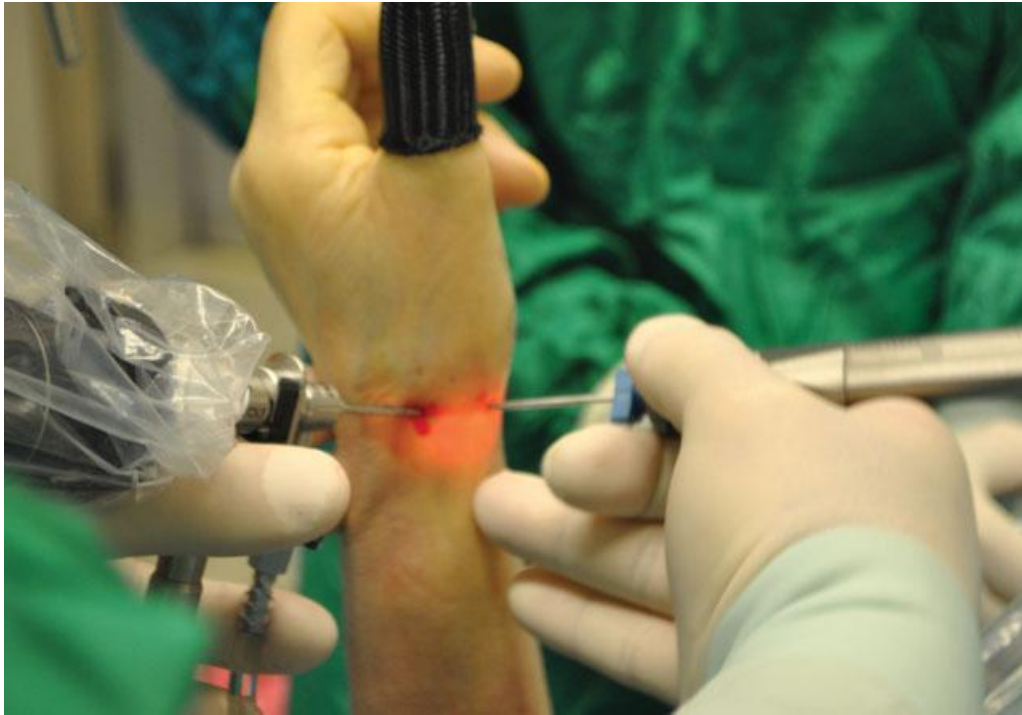
Fig. 1 The arthroscopic evaluation of the CMC joint by using a 1.9 mm optical camera. CMC, carpometacarpal.

hook of the special K-wire which is thicker at the proximal two-thirds. Then one of the suture buttons was placed in the tenar area, under the muscles to prevent the button from being felt under the skin. To decide the tension for suture button arthroplasty, after terminating the thumb traction without removing the Chinese finger trap from the thumb, the thumb was positioned by an assistant in suffi-