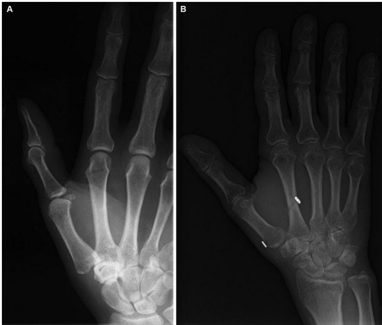
Fig. 3 (A) Preoperative radiographs of a 47-year-old man with a first CMC Eaton–Littler stage 2 arthrosis. (B) Postoperative day 1 radiographs of the same patient with first CMC Eaton–Littler stage 2 arthrosis treated by arthroscopic hemitrapeziectomy and suture button suspensionplasty. CMC, carpometacarpal.

the suture were pushed into the intermetacarpal space which was covered with interosseous muscles. The skin incisions were sutured by a rapid vicryl and a cast was not applied. The rehabilitation was started on the 2nd post-operative day and the patients were admitted to use their operated hands after the pain relief. The patients were allowed to do pinching and grip exercises as much as they could tolerate pain in the postoperative 2nd day. We did not apply a splint to our patients during postoperative period. Please refer to online version for ►Videos 1, 2, 3.